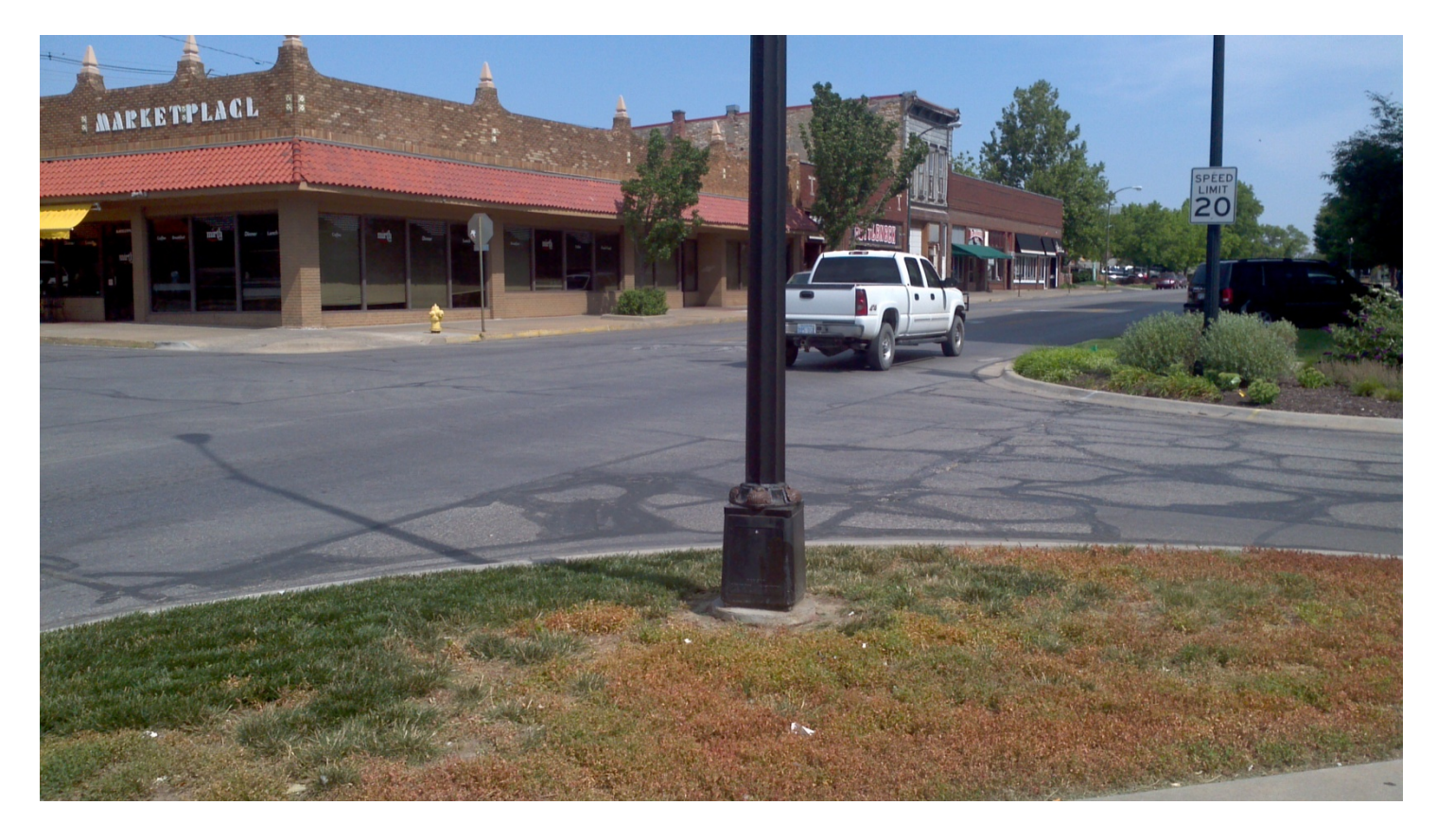
Saturday - Corner of 8<sup>th</sup> & New Hampshire – back 2' southwest of the existing pole.