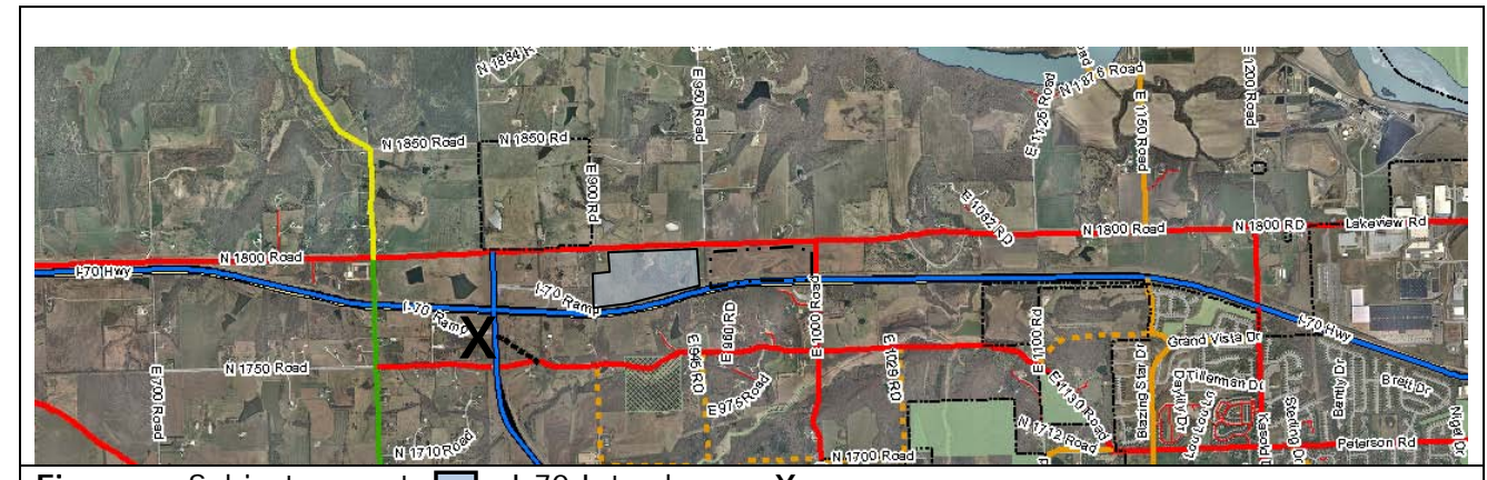
Figure x. Subject property ☐ ; I-70 Interchange X Subject property to K-10/I-70 Interchange: approximately 1 mile

Horizon 2020 acknowledges the need for industrial development for job growth. The plan encourages adequate site availability. Approval of the rezoning provides additional opportunities to market and development industrial projects. If this request is approved, additional development standards including platting, site planning, and compliance with applicable design guidelines will be considered with future development applications.