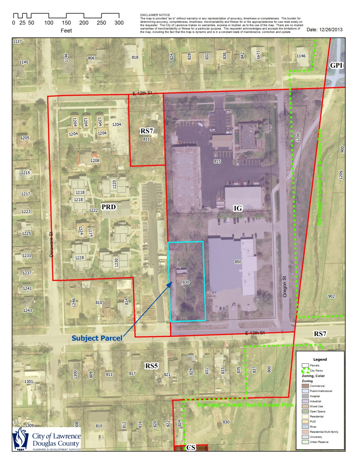
Figure 2: Base Zoning Districts in surrounding vicinity.

The boundary of the property which is the subject of this rezoning request is outlined in blue.