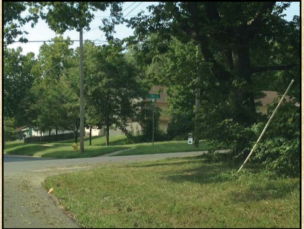
Southbound on Laura Avenue