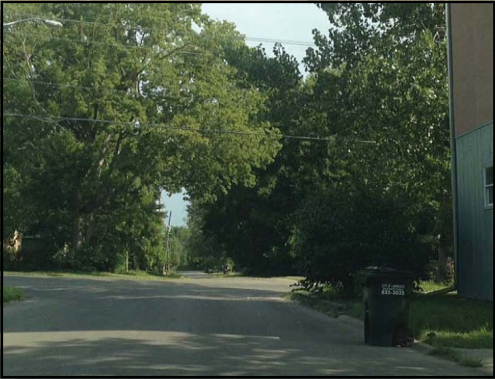
Northbound on Maple Lane