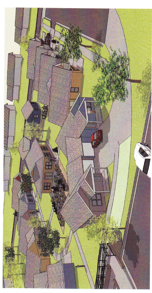
INTERIOR VIEW LOOKING NORTHEAST