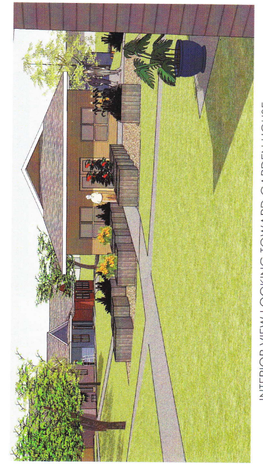
Interior view Looking Toward Garden House