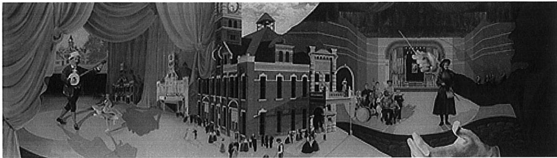
Junction City Proudly Presents , C.L. Hoover Opera House Mural Second Floor, 10' x 30', Junction City, Kansas. Artists: Amber Hansen and Nicholas Ward. 2008