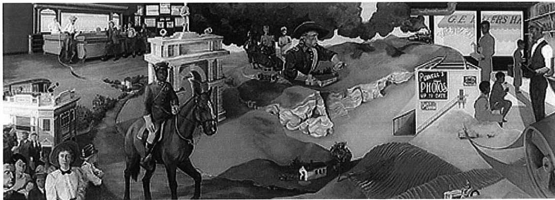
Picture History , C.L. Hoover Opera House Mural First Floor, 8' x 30', Junction City, Kansas. Artists: Amber Hansen and Nicholas Ward. 2008