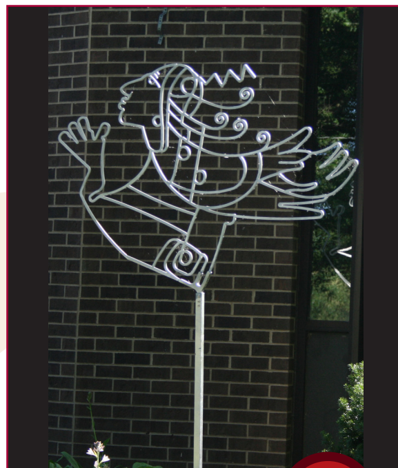
"NATIVE SPIRIT GUIDE" Asia Scudder Oklahoma City, OK