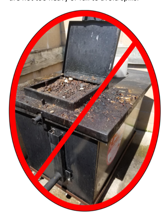
Tip: Never leave your grease dumpster open or covered in grease and old food.