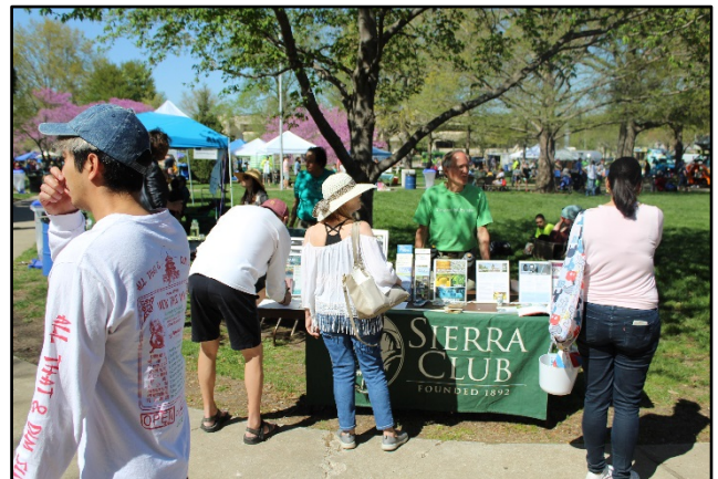
Left: Lawrence Drives Electric hosted a pop-up car show after participating in the Earth Day Parade. Right: The Sierra Club, which is the oldest grassroots environmental group in the United States, provides information and an origami butterfly activity.