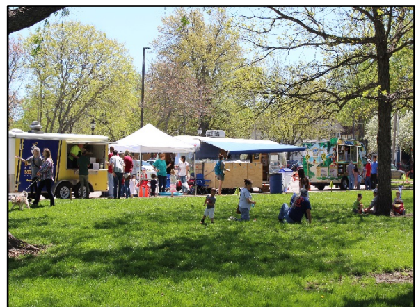
Left & Right: Celebration attendees got to choose from seven local food vendors, including Boyer's Artisan Meatballs, KANbucha, Torched Goodness, Queen of Tarts, JB's Tacos, Sarah's Sweet Tarts and Treats and Kona Ice.