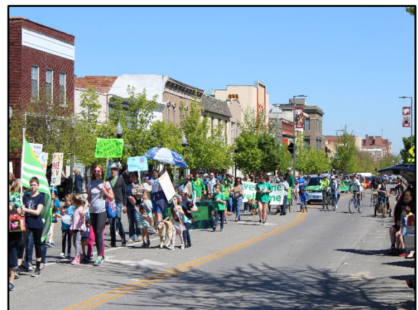
Left: Parade onlookers received free bananas from The Merc Co-op. Right: 15 local groups participated in the Parade. Joining them were many families and community members who took part by walking with handmade signs and displays or riding scooters and bikes.