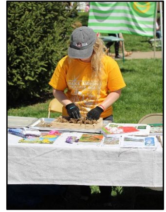
Left: KU Enviros provided a DIY planting station for kids. Center: Good Energy Solutions educates visitors on the benefits of solar energy. Right: Native Lands LLC prepares their educational material on native plants, natural areas, and gardening for wildlife.