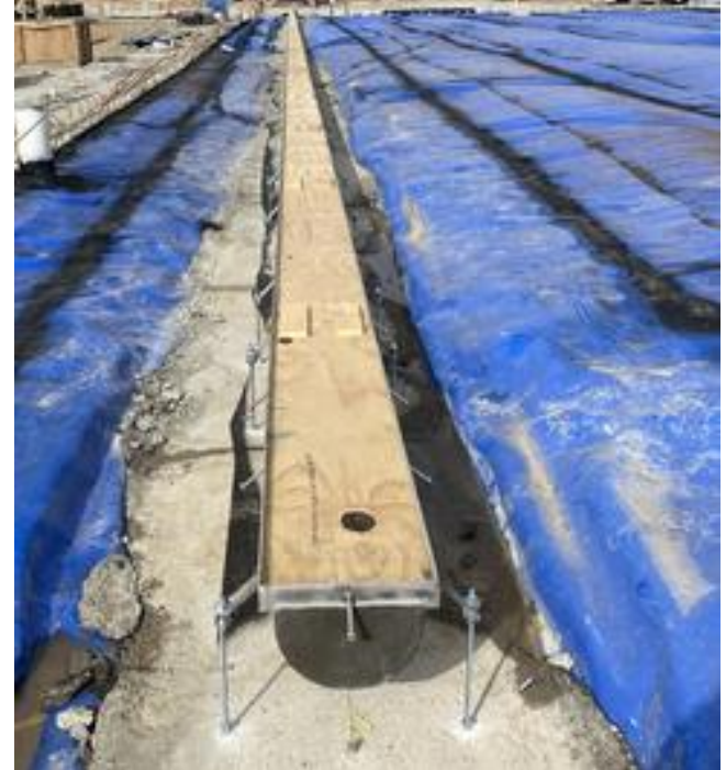
Trench Drain & VIMS