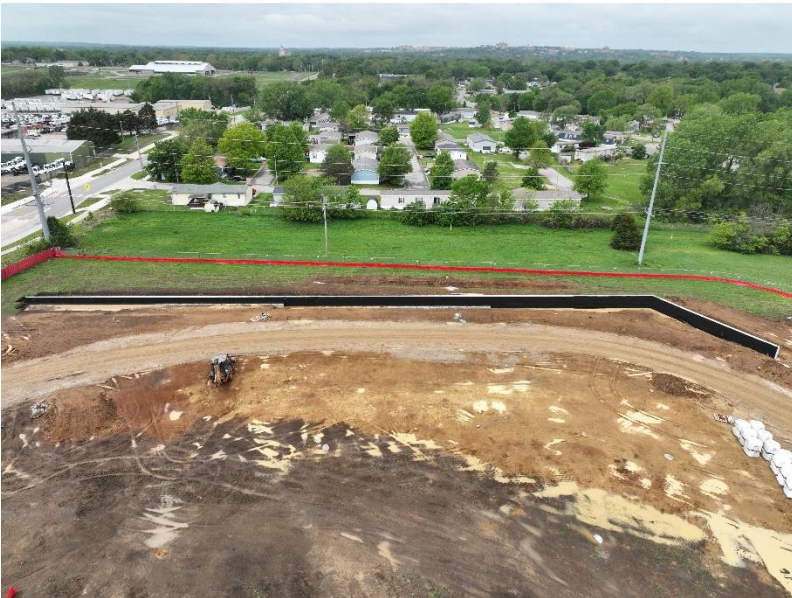
Sound Wall at New Entrance